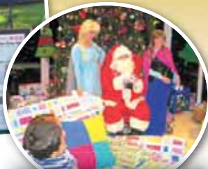
Queens West Brings Holiday Cheer to Ronald McDonald House