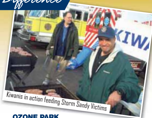
Kiwanis in action feeding Storm Sandy Victims