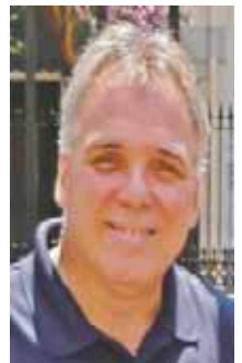
BOB KUEBER LT GOV DESIGNATE 2015