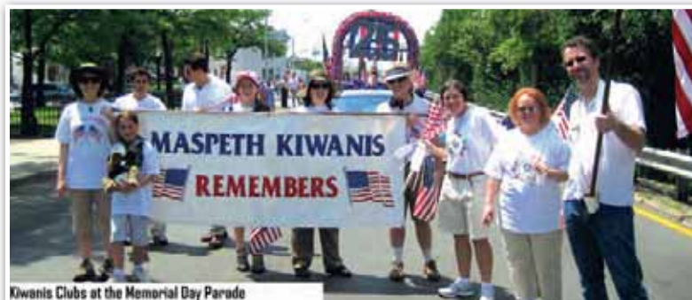
Kiwanis Clubs at the Memorial Day Parade