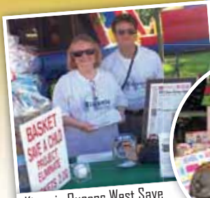
Kiwanis Queens West Save Children for International Project Eliminate