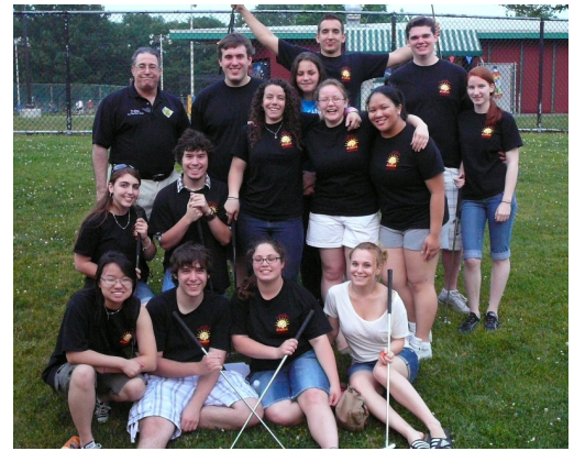
NYCKI District Board Attends LISC Kiwanis Mini-Golf Fundraiser during Summer Board Meeting

June 2011 22-26 CKI Convention Virginia Beach, VA Bring it to the Beach!!!