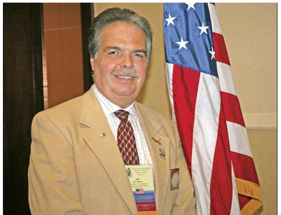
Brooklyn Division Distinguished Past Lt. Governor becomes New York District Foundation Board President in Buffalo. Congratulations!