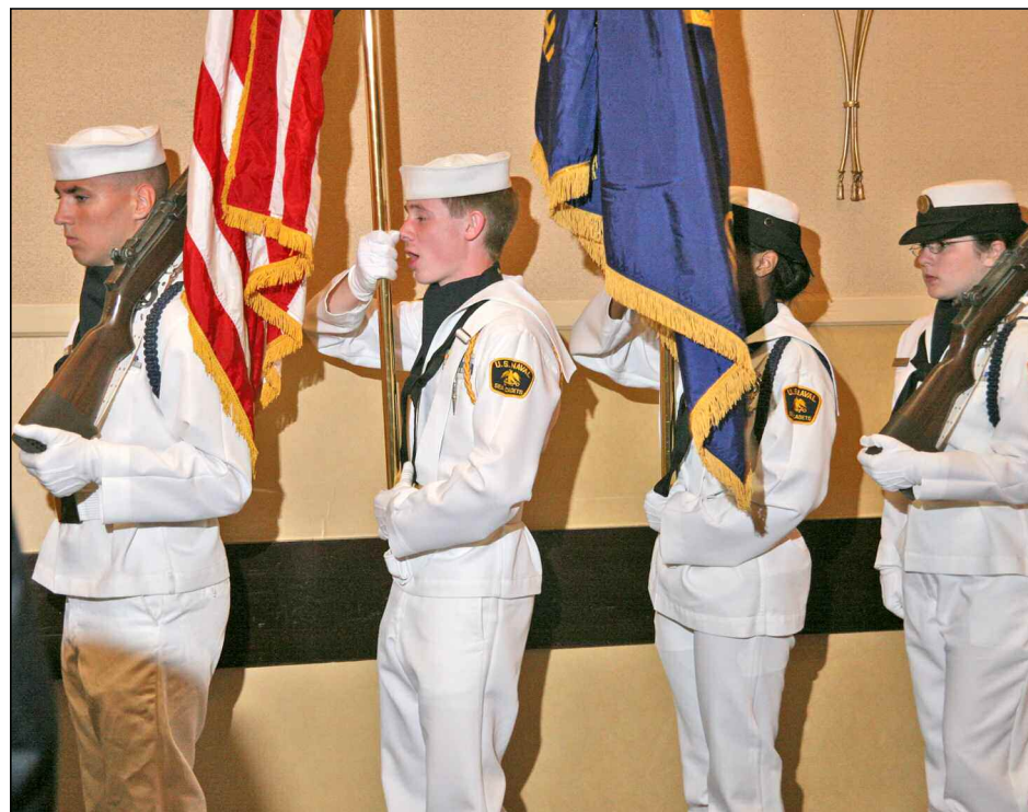
The Buffalo US Naval Sea Cadets offered a procession of service flags, as well as retiring the colors at the end of the service.

The Veterans Certificate on the left was given out to Kiwanians to distribute to their club members who served in the armed forces. If you wish to have this document emailed to you, please send an email to: NYKIWESK@aol.com and we will be glad to forward it to you.