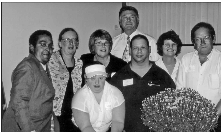
Newark Aktion Club

The Kiwanis Club of NEWARK , Finger Lakes Division – is celebrating 25 years of service to the community and Wayne county. The club was chartered in June 1980.