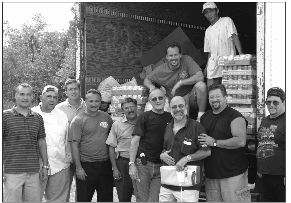
New York Kiwanians load a 48' Tractor with food and items for fellow Kiwanians in the Gulf area. The truck was filled to the top with much needed supplies.