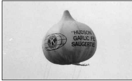
A Garlic Bulb floats above enticing community to come and enjoy the glorious weather and Garlic Festival.