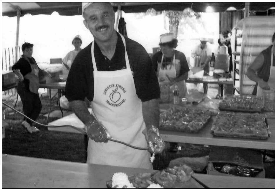
Governor Glenn puts on an apron and prepares the famous Peach Shortcakes.