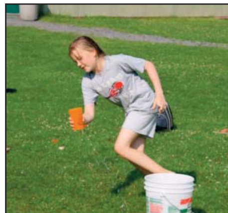
Kamp Kiwanis 2014