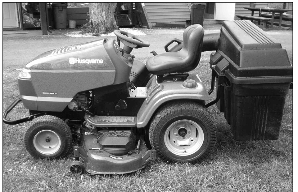
Kamp Kiwanis was in need of a tractor and the Susquehanna came to the rescue.