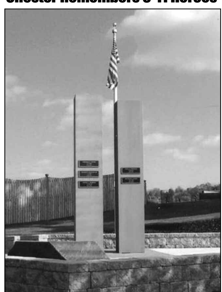
Chester, NY is the site of the Chester Kiwanis 9/11 Remembrance Memorial.