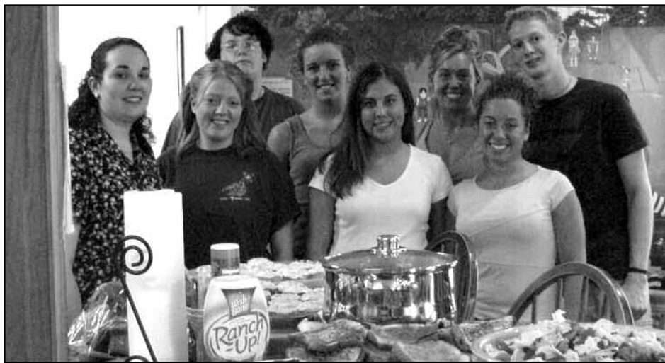
Mt. Morris Key Club works hard preparing food at Ronald McDonald House.

Thanks to their service clubs, like Key Club, these seniors have helped make an impact on society. The Key Club would like to