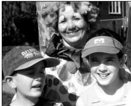
Arty's Parties Clown entertains children during the Street Fair.