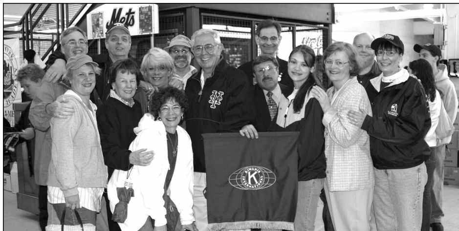
Kiwanians have fun and raise money for KPTC.