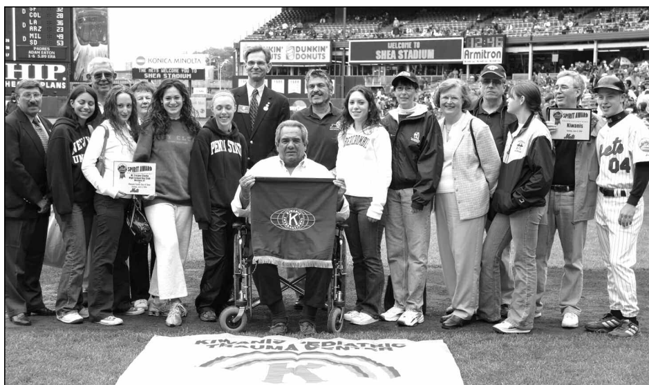
Kiwanians and Key Clubbers pose for a photo on the field at Shea prior to the game.