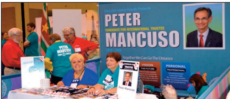
The candidate's booth in the convention Exhibit Hall was staffed by volunteers.