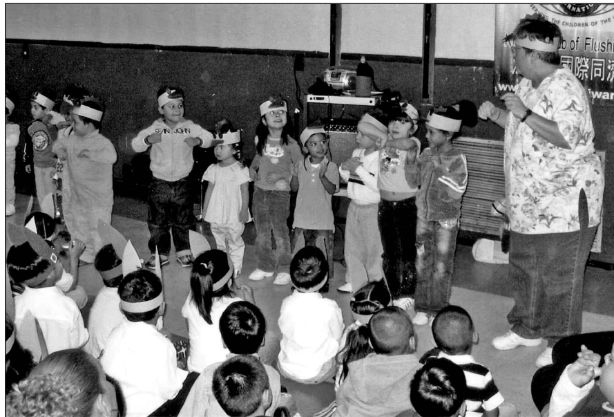
Children and their teacher at the Shield School do the bunny hop at Easter Party sponsored by the Kiwanis Club of Flushing, Queens East Division.