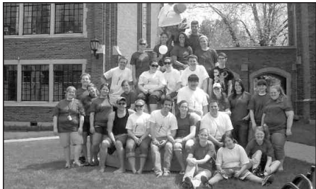
Attendees of the 2008 Circle K Olympics at Elmira College.

That very same weekend, we drove from Taberg to Elmira to participate in the Circle K Olympics, which is an event held by Elmira College's Circle K club every year. Events included and old favorite—eating a donut from a string without using your hands.