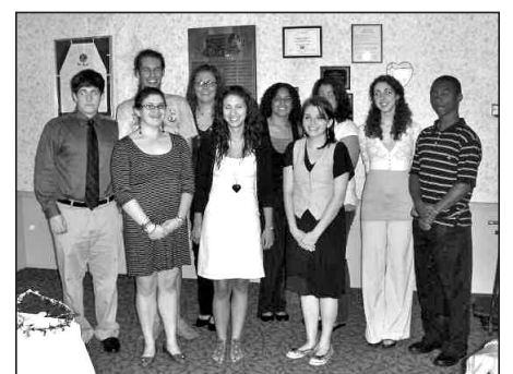
Monticello Scholarship Award Winners. Ursula Good Memorial $500.

Let's keep the program moving at all locations and associate Pediatric Trauma Coverage with the Kiwanis organization!