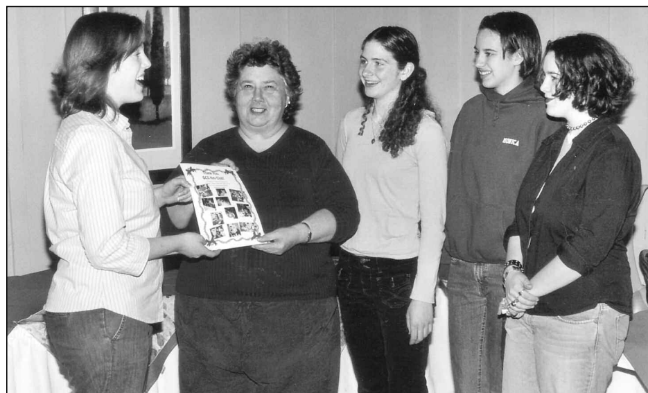
Onondaga Hill Key Club.