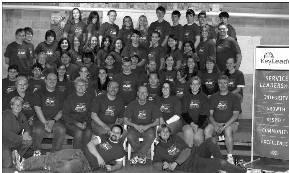
Above: 42 students and 8 adults at Camp Stella Maris in Livonia for the first Kiwanis Key Leader weekend in New York for 2006 join for a photo. The students came from Western New York and a few from Pennsylvania.