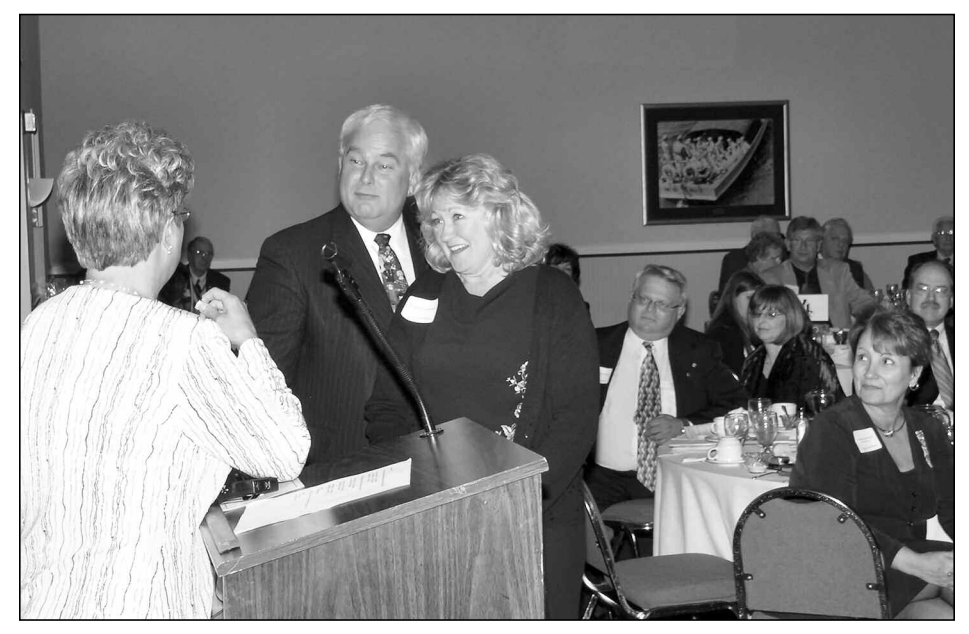
Clubs in attendance, as is tradition, presented gifts.