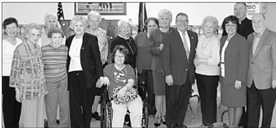
Members of the Crochet Club at Monica Village with officials from the Holy Name of Mary School and the Valley Stream Kiwanis Club.