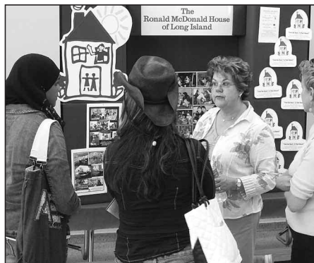
Key Clubbers learn how they can volunteer at Long Island's Ronald McDonald House