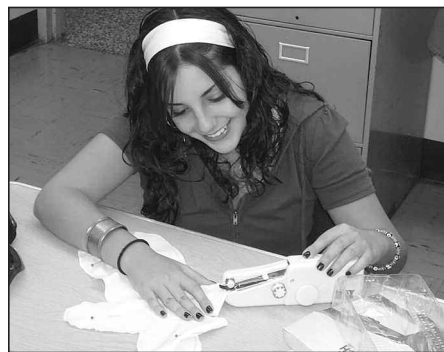
Island Trees Key Clubber stitches her Kiwanis doll for a pediatrics patient.