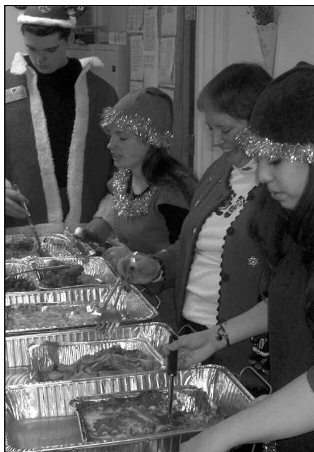
Key Clubbers and Kiwanians bring Holiday Cheer to ACLD House residents.

After all the residents' families had arrived, the Kiwanians and Key Clubbers served a hot buffet dinner prepared by the staff of the ACLD residence.