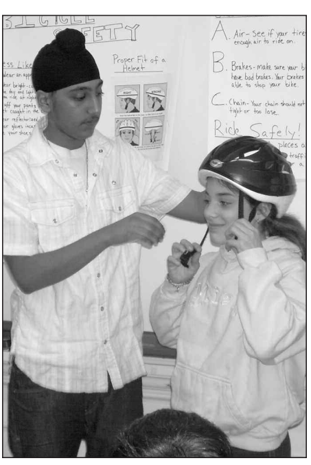
Sumett in action.