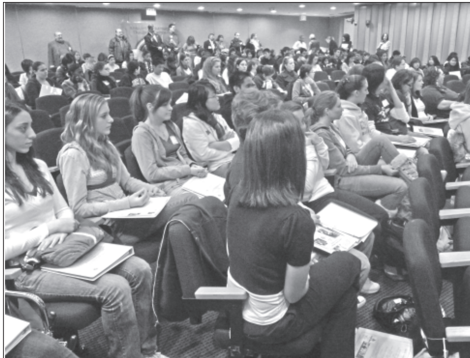
Key Clubs attend Injury Prevention/ Safety Education Day at North Shore University Hospital.