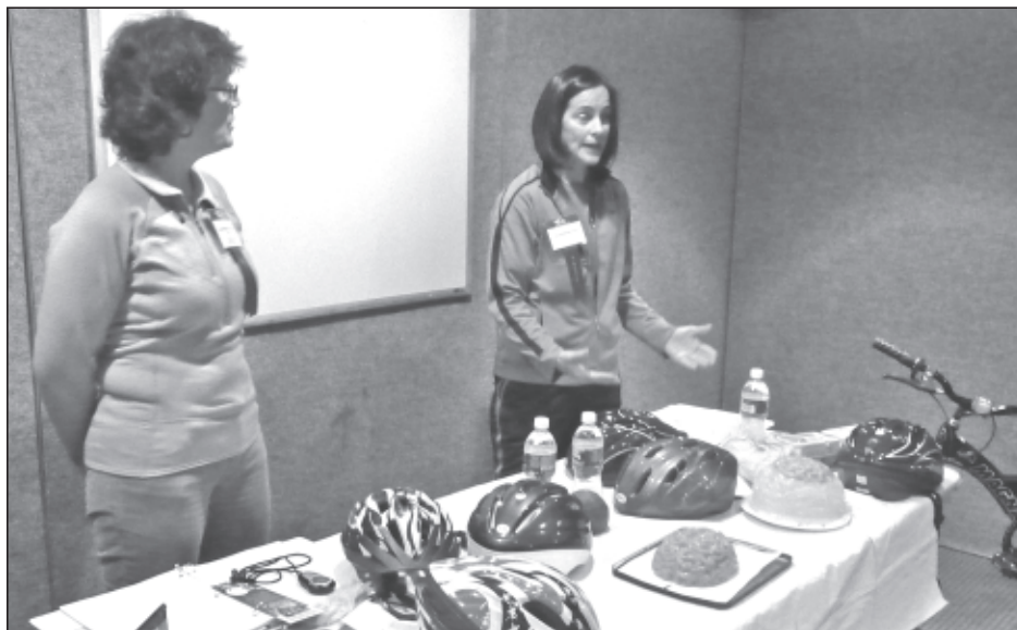
Bicycle Helmet Safety facilitators present plan for teaching safety to youngsters. Key Clubbers gained an understanding of the importance of wearing a bike helmet, how to choose and fit a bike helmet properly, and they became aware of the damage that might be caused to the brain if an accident should occur to riders without a helmet.