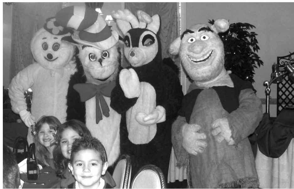
Cartoon characters entertain the children.