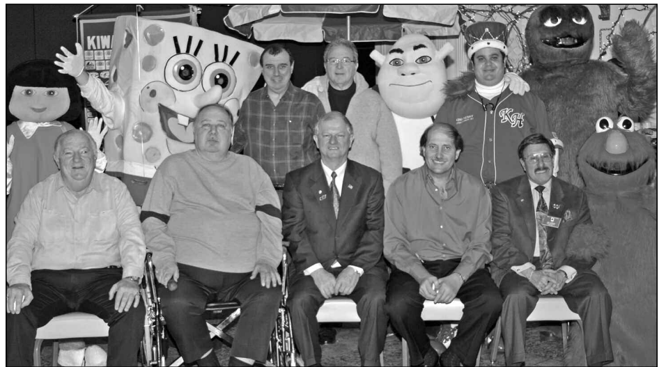
The Kiwanis Club of Bensonhurst and Bay Ridge, Brooklyn Division, created a Christmas Party hat brought joy to many kids and their families.