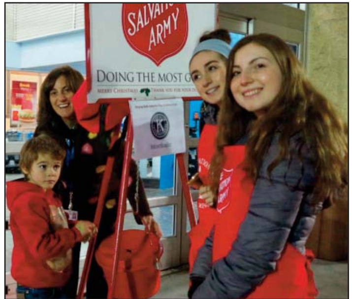
A young boy donates to the Salvation Army.