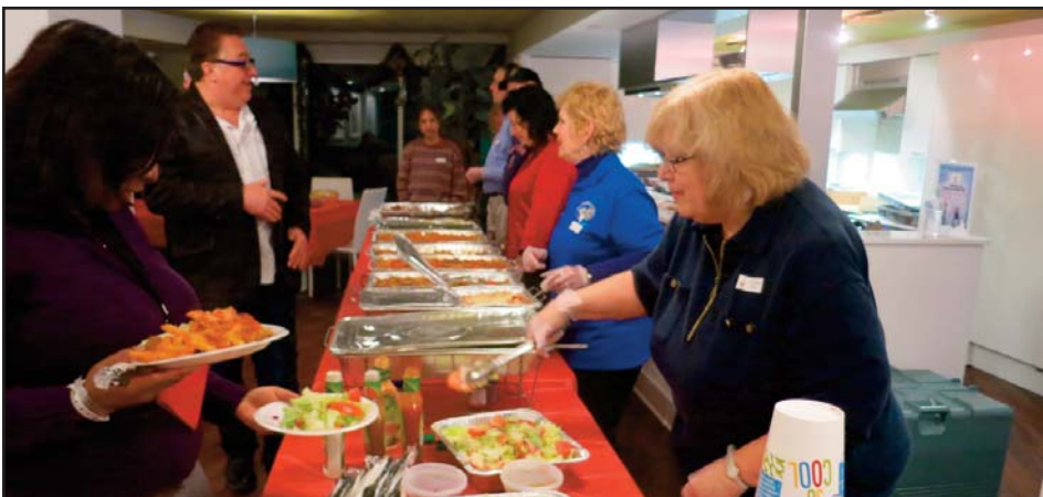
Queens West volunteers serving dinner.