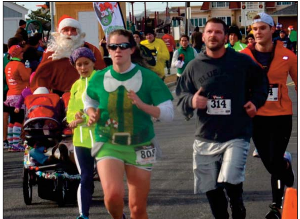
The Patchogue Toy Trot features many runners in seasonal costumes.

The Center gives books to the children to take home each week. The children love to read, and the center hopes that the books will help them build their own personal libraries.