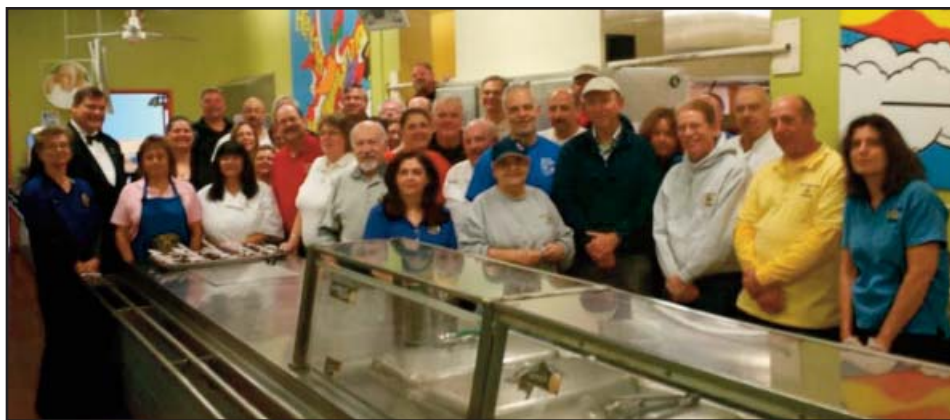
East Meadow Kiwanians at the dinner.

With all this food, our delivery truck was not big enough to move the food to Clarke High School so, with the help of our membership we had a convoy of