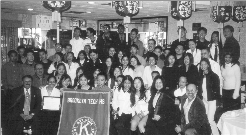
Brooklyn Tech HS Key Club, Childrens Colony Prep Builders Club and Mapleton Club.